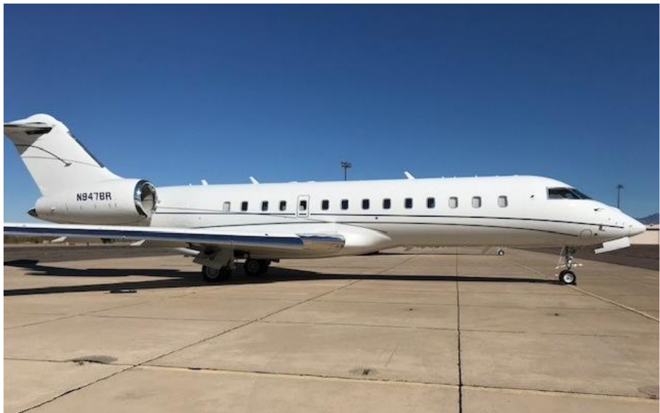
Paint Just Completed February 2020