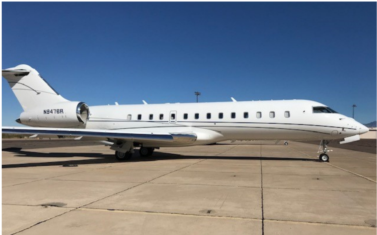
Paint Just Completed February 2020