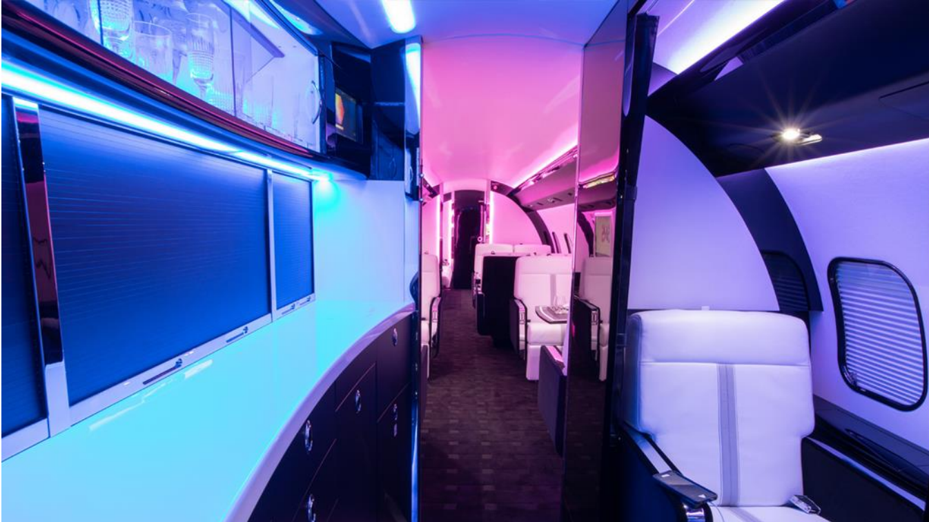
Customizable triple zone LED lighting