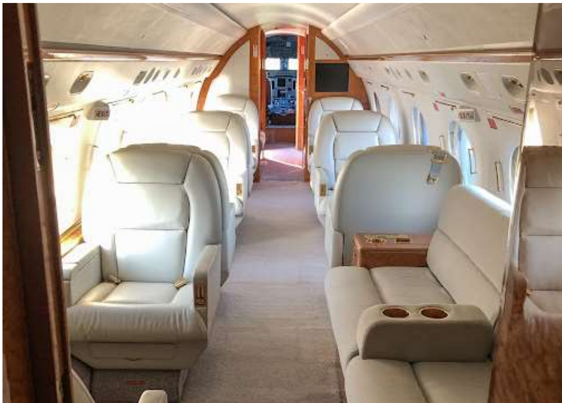
Aft Bulkhead Removed