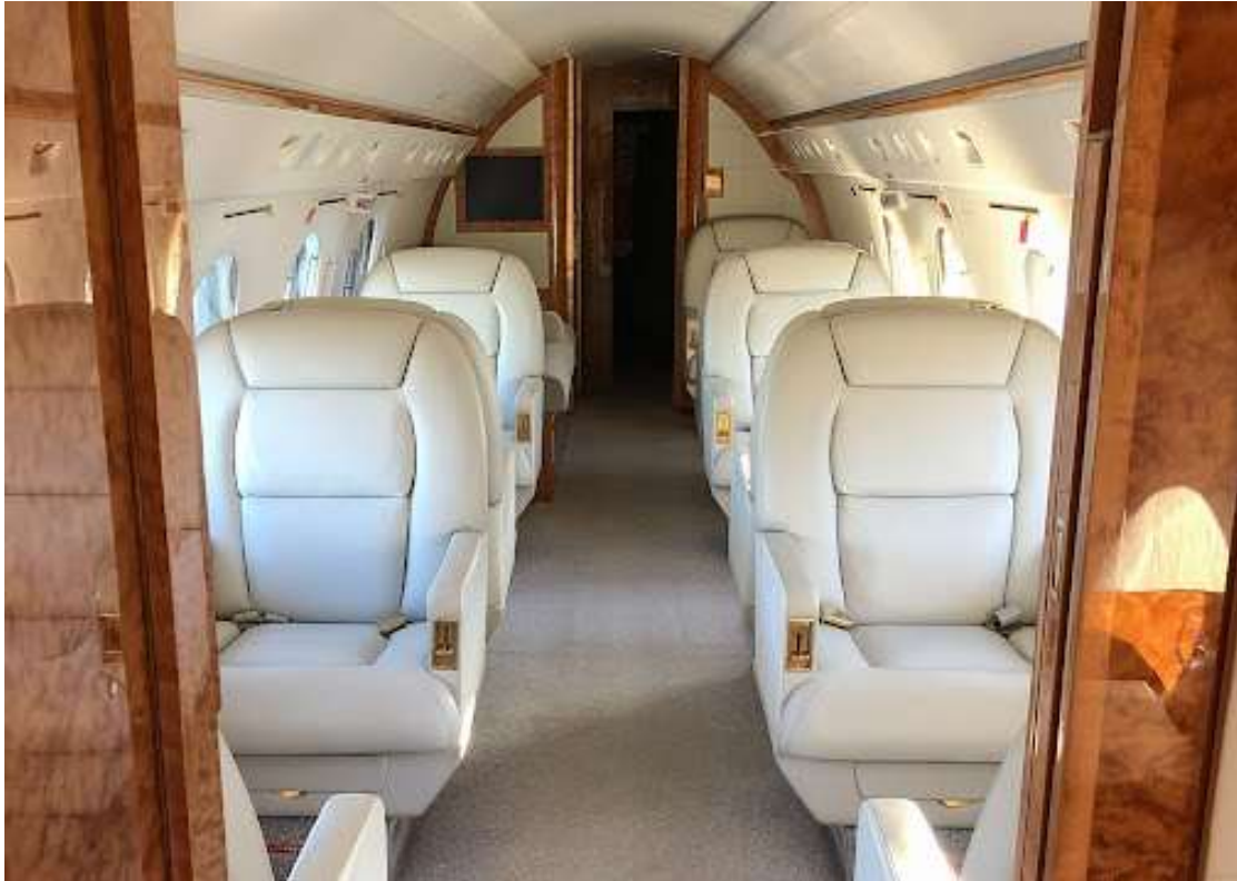
Aft Bulkhead Removed