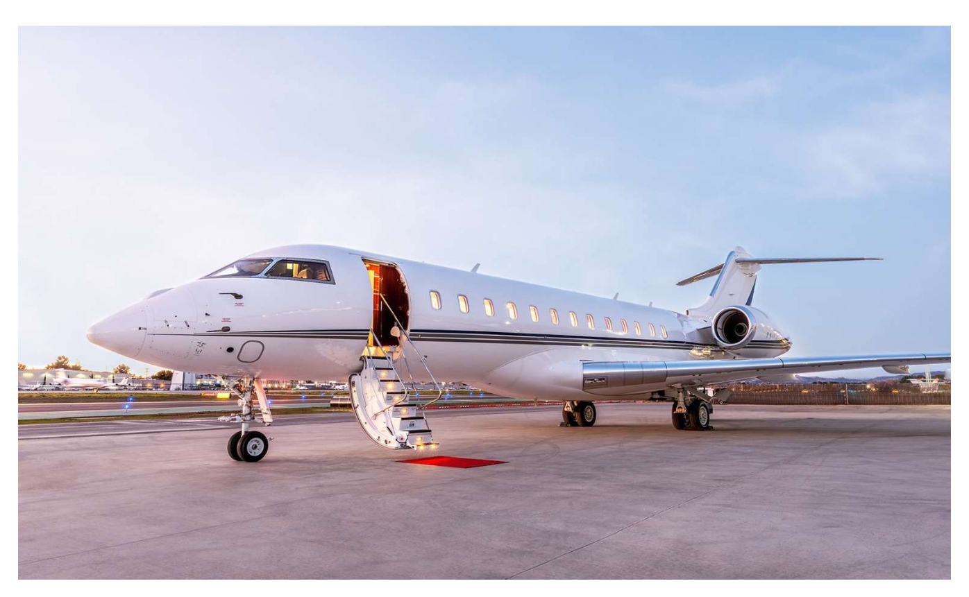
Overall White with medium gray and dark blue scent stripes. Teflon Coating. Exterior: